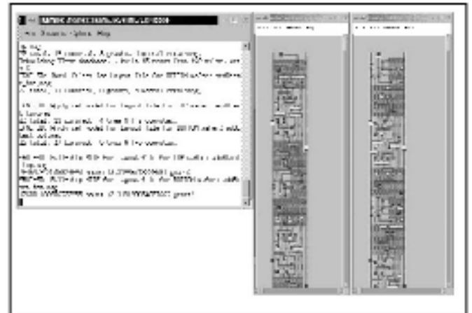
Fig. 12: Graphical User Interface of ERNI-3D. Here ERNI-3D is run on a 2-wafer 3D 8-bit Adder layout.

The reliability CAD tool, ERNI-3D, parses 3D circuit layouts and extracts both conventional and 3D interconnect trees. It employs the Hierarchical Reliability Analysis approach, and filters out a group of immortal trees using their current-density length products. After the filtering process, more accurate, but more computation-intensive reliability models are applied to the remaining interconnect trees to compute their median and mean times to failures. Finally, all the different times to failures are combined using a joint probability distribution to report a single reliability figure for the whole chip. This initial version of ERNI-3D treats 3D circuits with two wafers or device-interconnect layers in the stack (see figure 12). However, the data-structures and algorithms in the tool are generic enough to make it compatible with 3D circuits with more than two device-interconnect layers and to allow the incorporation of more sophisticated reliability models in the future. Future work will also include modification of ERNI-3D to account for newly discovered differences in the geometry dependence of the reliability of Cu-based interconnects compared with Al-based interconnects.